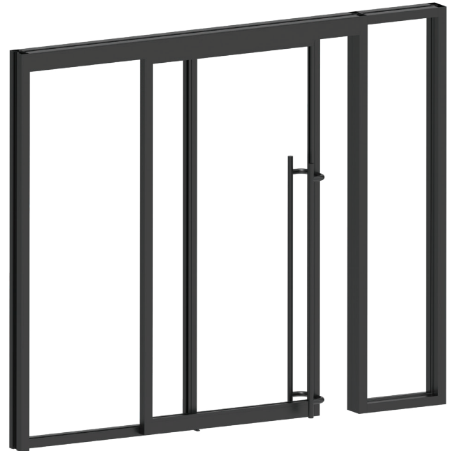
630 Integrated with Sliding Door